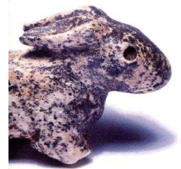
PERDIGÕES COMPLEXO ARQUEOLÓGICO Núcleo Expositivo da Torre do Esporão ARCHAEOLOGICAL COMPLEX The exhibition at Torre do Esporão