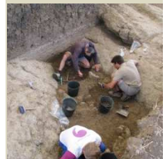
Excavating at Perdígões.