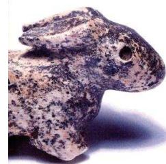
PERDIGÕES COMPLEXO ARQUEOLÓGICO Núcleo Expositivo da Torre do Esporão ARCHAEOLOGICAL COMPLEX The exhibition at Torre do Esporão