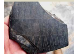
Decorated schist plaque collected at surface in the central area of Perdigões