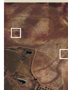
Excavation areas in 2009