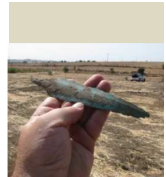
Beaker dagger collected at surface in the central area of Perdigões

PERDIGÕES COMPLEXO ARQUEOLÓGICO Núcleo Expositivo da Torre do Esporão ARCHAEOLOGICAL COMPLEX The exhibition at Torre do Esporão