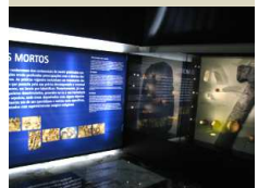
Perdígões exhibition in medieval tower at Herdade do Esporão (Reguengos de Monsaraz)