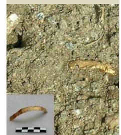
Gold metallurgy at Perdigões