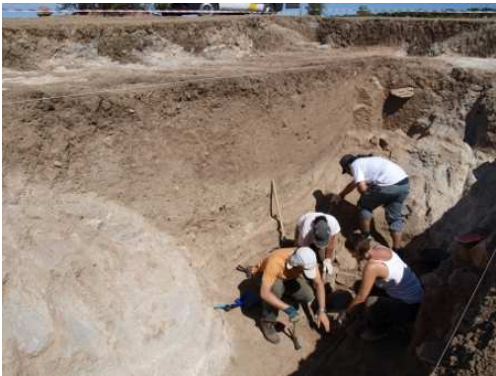
Excavation in Ditch 1.

This first intervention of Málaga's team (which will continue next year) starting to render concrete the ambition of bringing other research projects and teams to collaborate in the INARP programme, and was a first local experience of interaction of two different teams working simultaneously in the field.