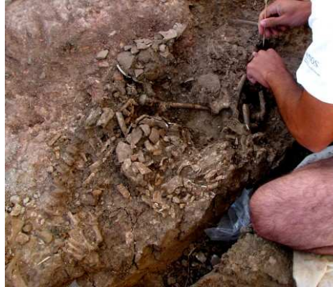
Pit human burial excavation in Sector I of Perdigões