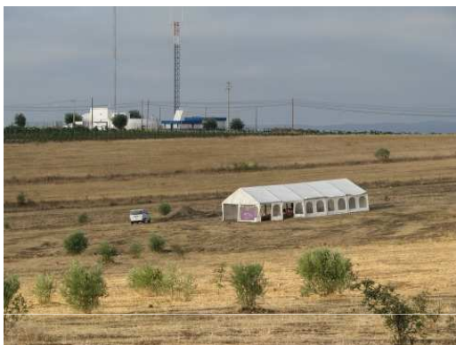
Location of the 2009 intervention.

In 2009, the Archaeological Research Group (NIA) of Era Arqueologia S.A. begun new excavations in the central area of Perdigões enclosure complex.